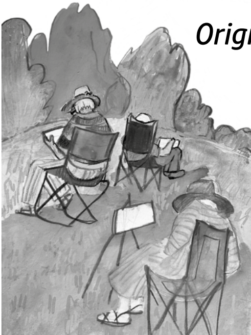
Artists at work!

to include a collection of felted squares reflecting the history of the Wimland's Shetland flock